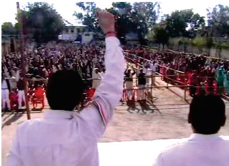
During the convention thousand of members unanimously came forward and passed a resolution in which they agree to donate Blood