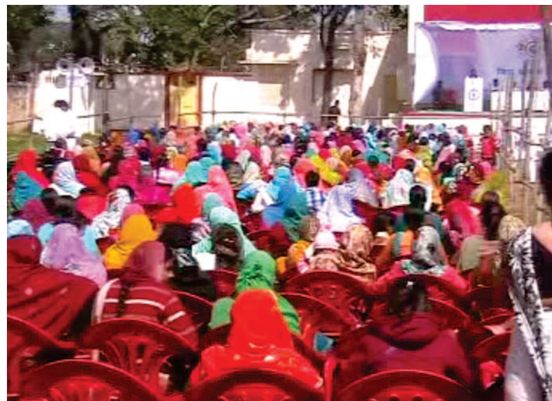
Participated thousand of members in Zila Kalyaan Samiti District Level Conference